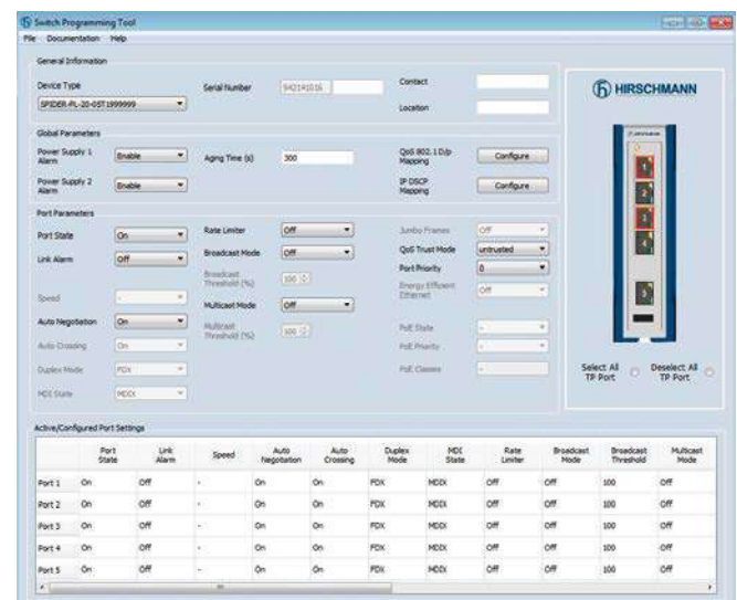
The stand-alone SPIDER Switch Programming Tool runs without installation (even from a USB drive), allowing for the customization of each individual port to the application's needs.